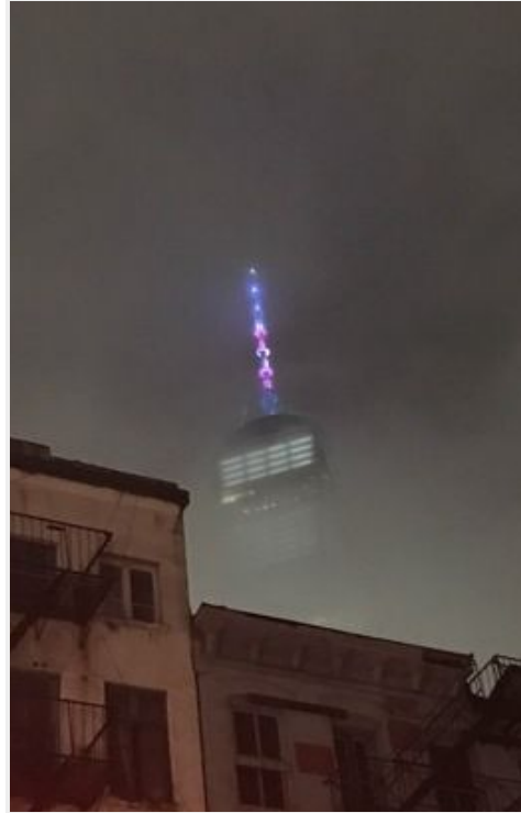
One World Trade Center Spire, New York, NY

https://www.lgbtqnation.com/2016/04/wells-fargo-lights-charlotte-office-tower-with-transgender-flag-colors/