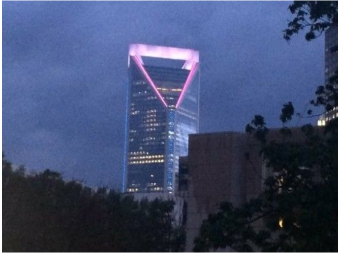
Duke Energy Center Tower, Charlotte, North Carolina