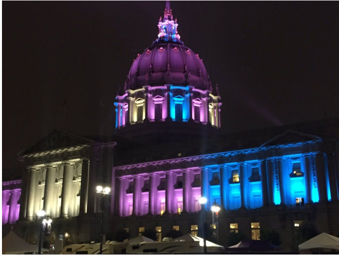
San Francisco (California) City Hall, San Francisco California, June 23rd 2017

https://twitter.com/CornellBarnard/status/878488823033769984